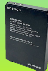
SL20-BATT-E50 SL20 Battery