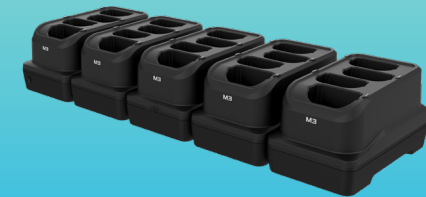
US20-20BC-C00 20-Slot charging only cradle