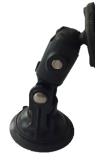
Ram Mount(Suction) UNIV-RAMS