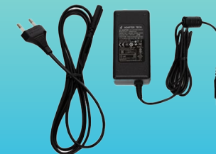
US20-PWSP-2XX power supply