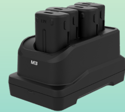
US20-04BC-C00 4-Slot Battery Charger

Fast Charging Extended Capacity Spare Battery 6,700mAh