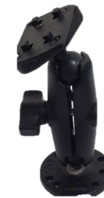
Ram Mount(Screw) UNIV-RAMT