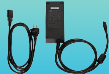
US20-PWSP-5XX power supply